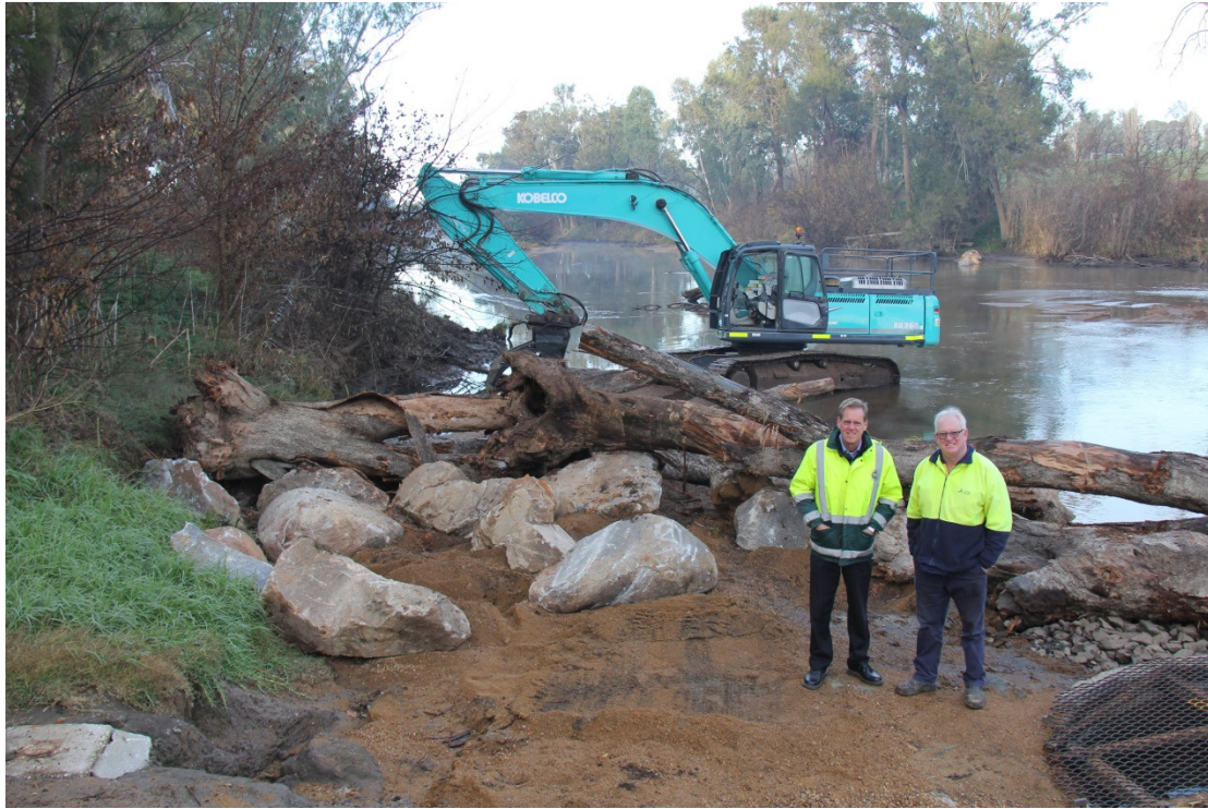
Works for the 'Comfortable Cod for Cowra' project